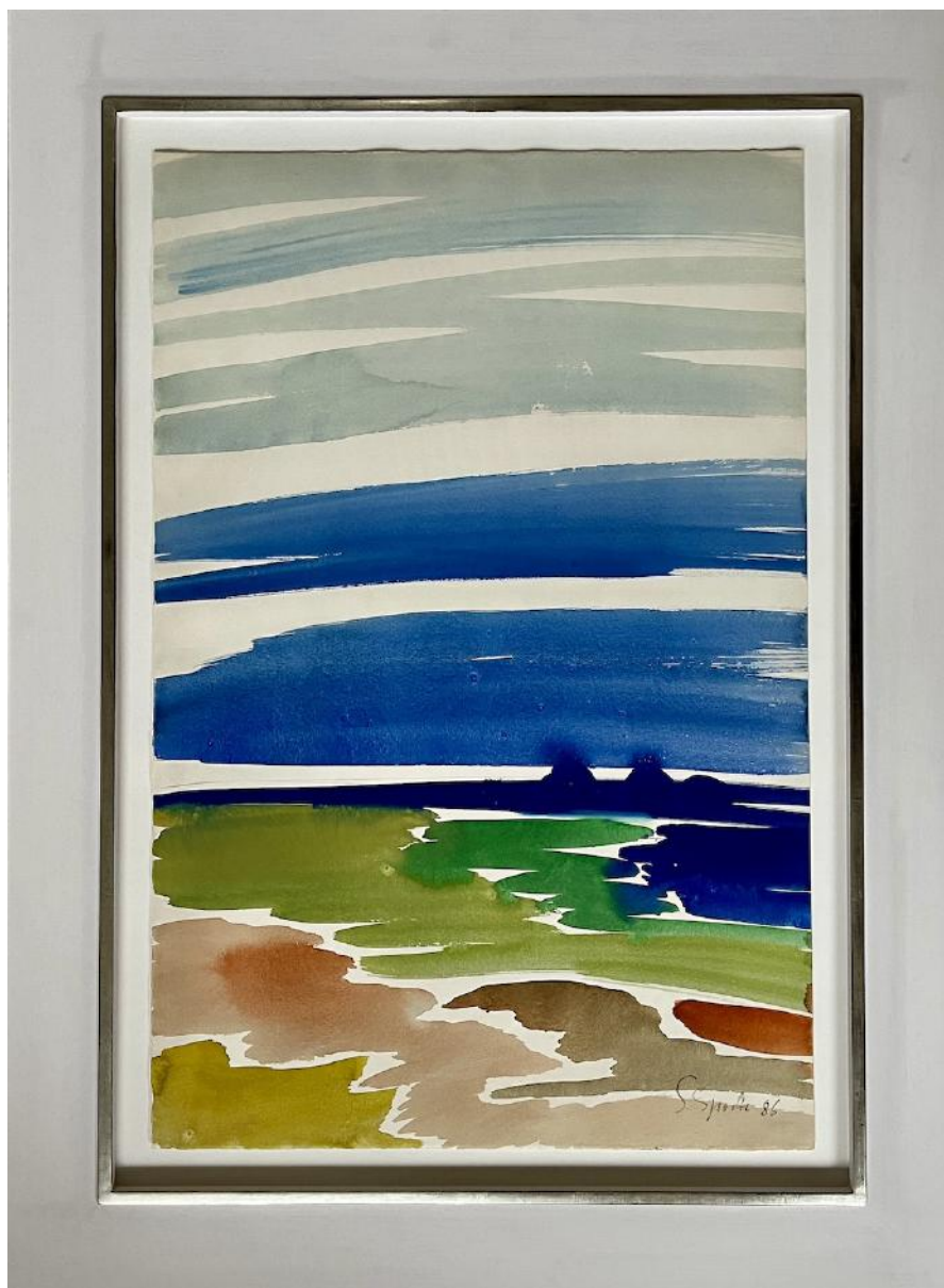
Sieghard Sprotte, Zyklus Hohe Himmel, 1986, watercolour on paper, 78,5 x 52 cm