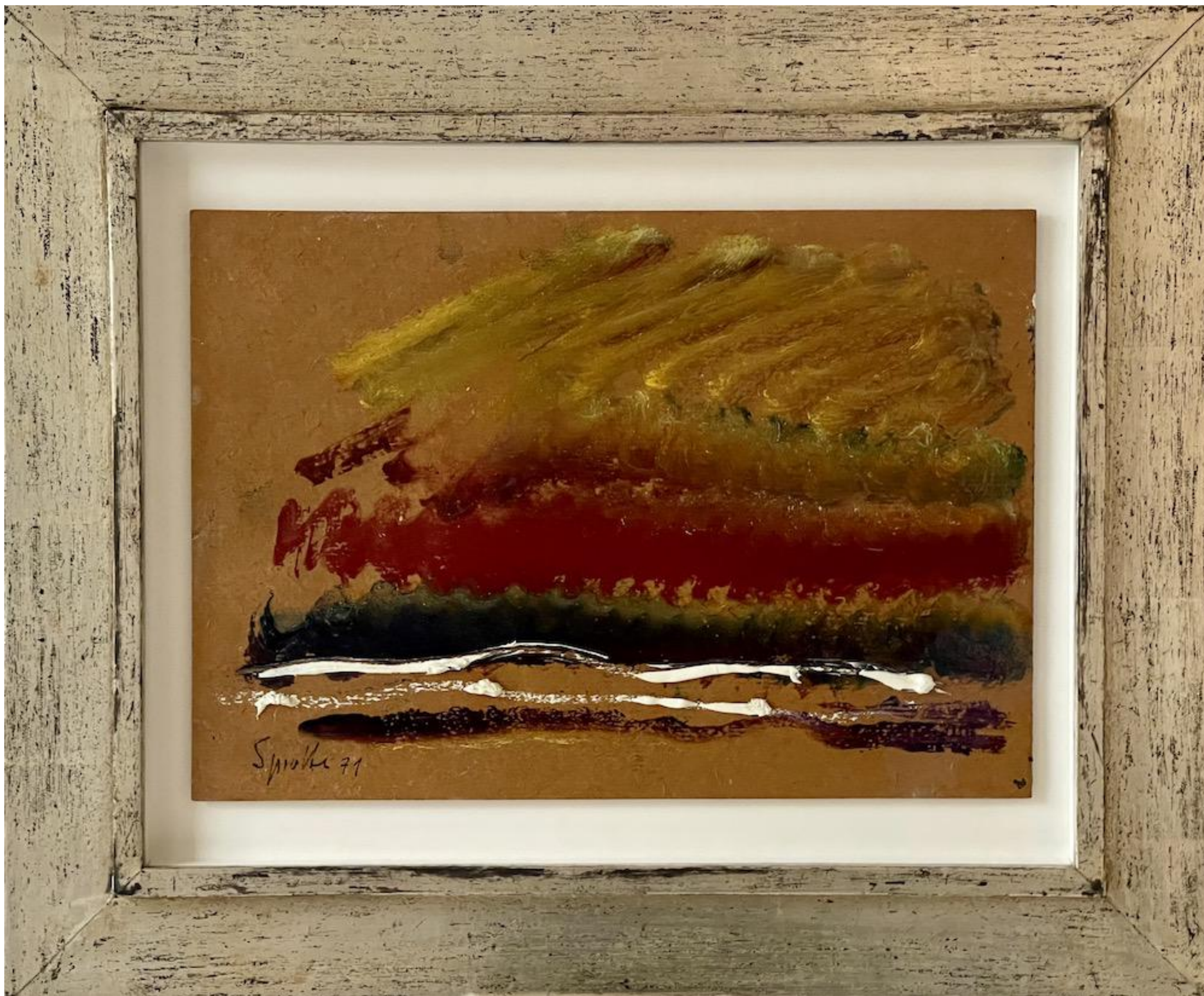
Siegward Sprotte, Sollinger Dialoge, 1971, oil on board, 21,9 x 31,4 cm