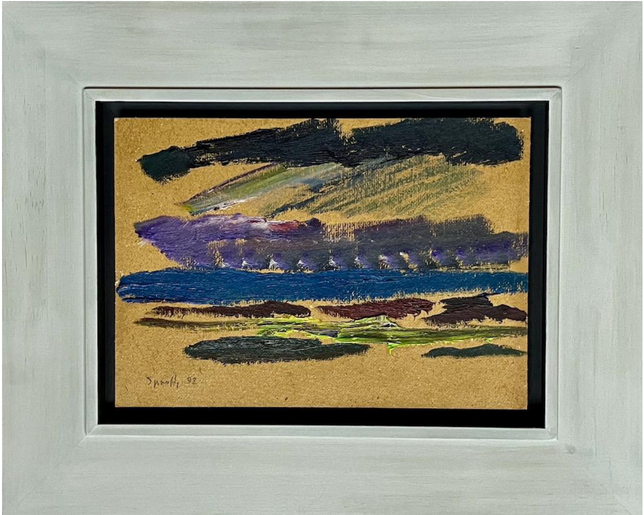
Siegward Sprotte, Colour sequences create landscape, 1992, oil on board, 25 x 35,5 cm