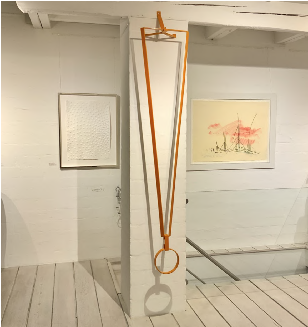
Andre Sander, "Do it", 2020, lacquered steel - RAL 2000, height: 216 cm