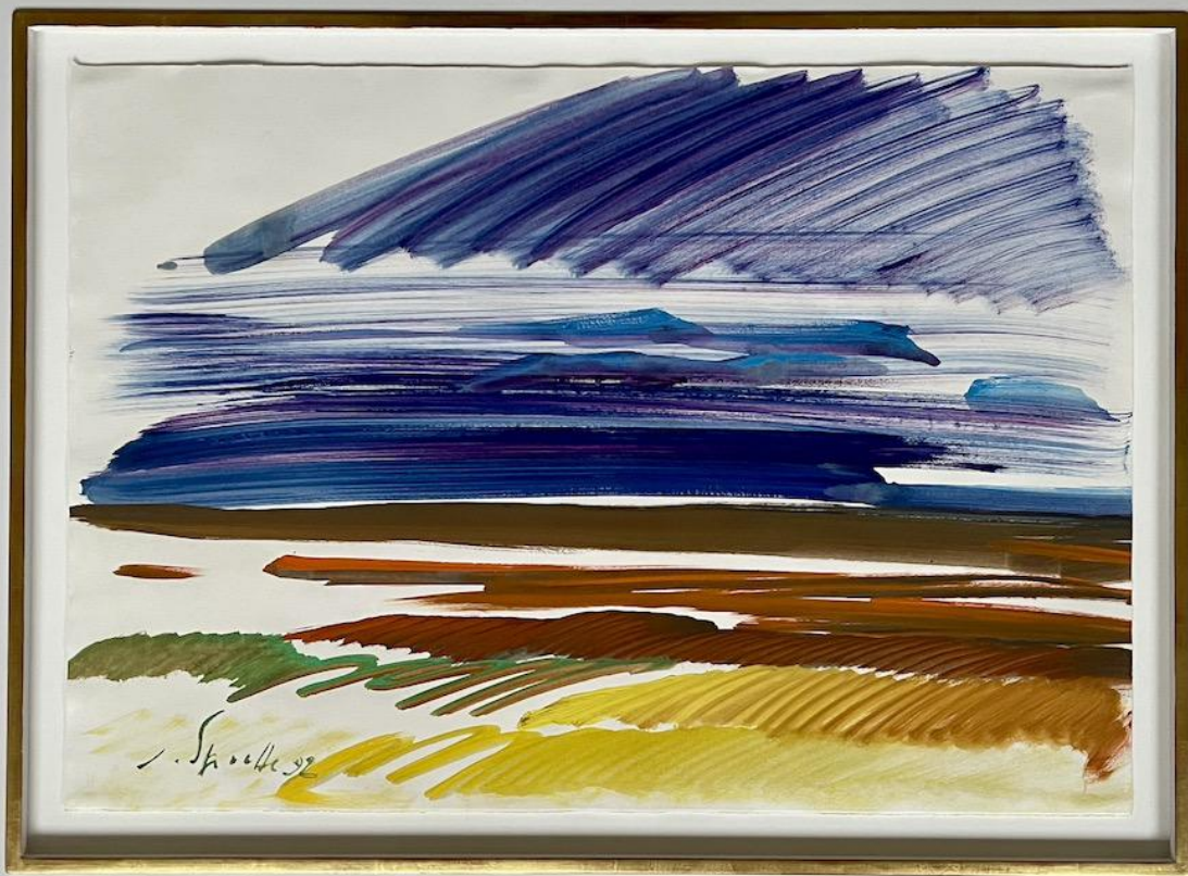
Sieghard Sprotte, Nordische Landschaft, 1992, gouache on paper, 53,5 x 76 cm