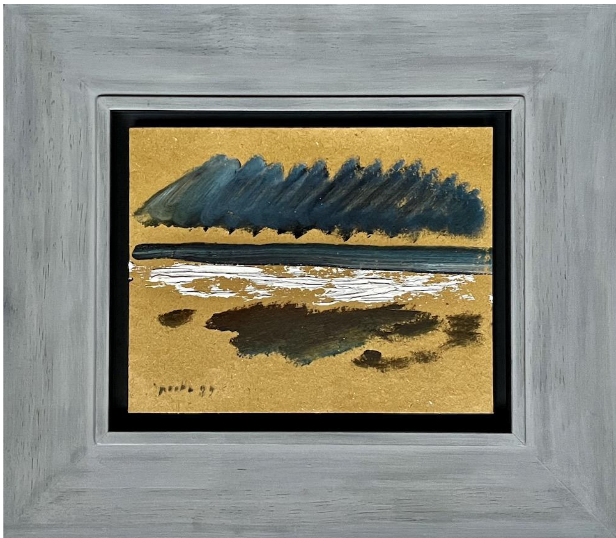
Sieghard Sprotte, "Day after Day a good Day" IV 1989, oil on board, 21,7 x 30,9 cm