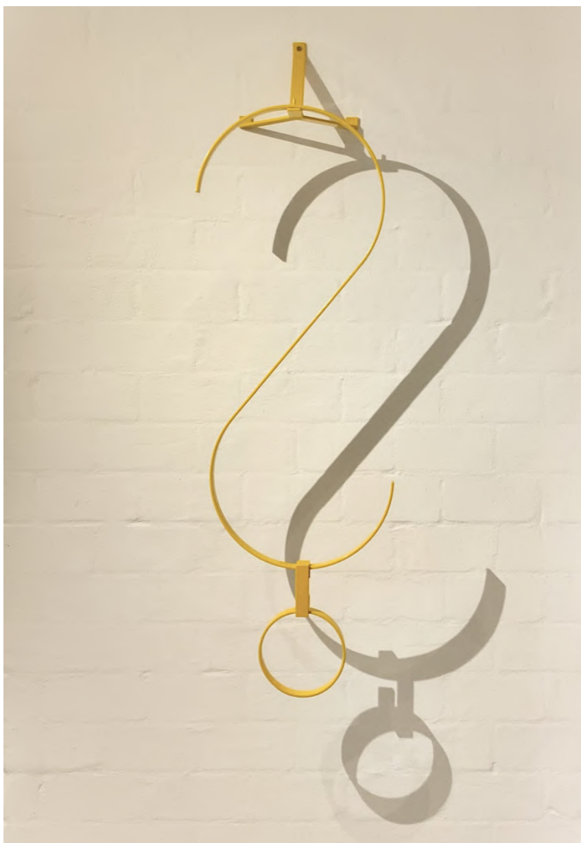
Andre Sander, "Always question", 2020, lacquered steel - RAL 1003, height: 163 cm